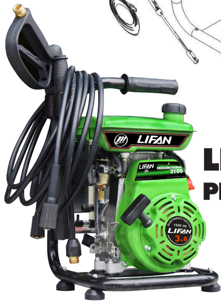
LFQ-2130 PRESSURE WASHER